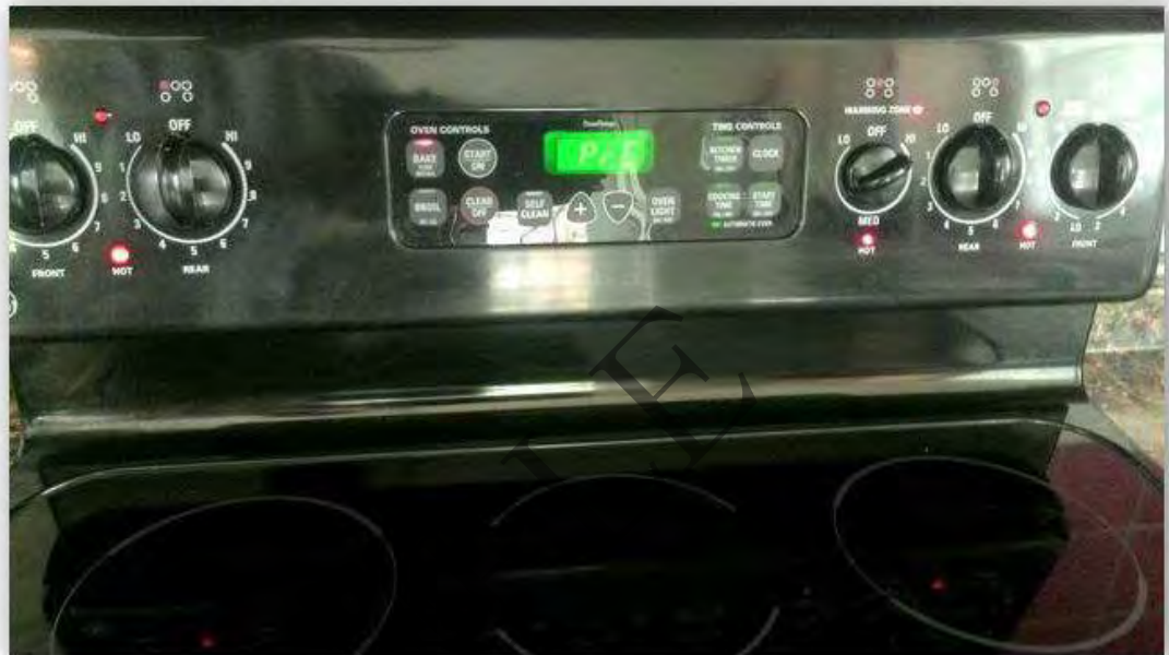
Cooktop photo. - " §535.232 (d) "

Additional Comments and Observations (This section may contain photographs that are not necessarily related to a deficiency.):